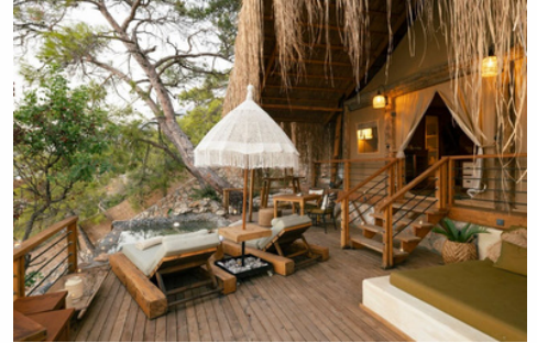
Honeymoon Panorama Suite